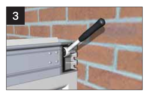
Where the eaves beam sits against the host masonry wall, it has a structural moulding attached to the eaves beam. This has three fixing positions cast into it to allow attachment into masonry – choose the hole that directly lines up with solid masonry and drill a 10mm hole into the host wall. Attach the structural moulding using the M8x80mm anchor supplied. Silicone seal the gap where the moulding attaches to the eaves beam.