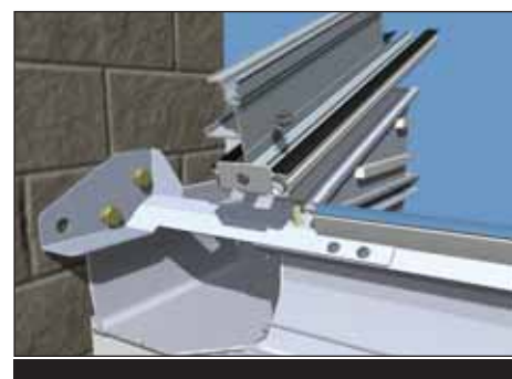
90° EAVES AND RAISED BACK BOX GUTTER ASSEMBLY

Note: Only two of the four holes are used.