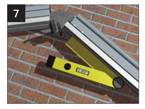
To set the ridge use an "angle fix" - check the starter bars are at the correct pitch. Chalk/pencil a line on to the wall to mark the pitch line.