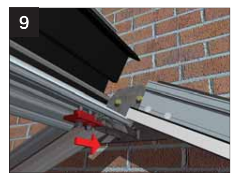
Loosen the "crocodile jaw" bolts on the underside of the main ridge body – ensure it is supported at the front whilst it is gently guided onto the top half of the 'crocodile jaw'.

Note: The starter bar is NOT attached (bolted) to the ridge body.