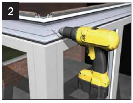
Two pilot holes already exist in the next piece of eaves beam – drill two more at 4.5mm diameter through the eaves beam and the cleat and then securely fit the four M5 x 12mm taptite screws.