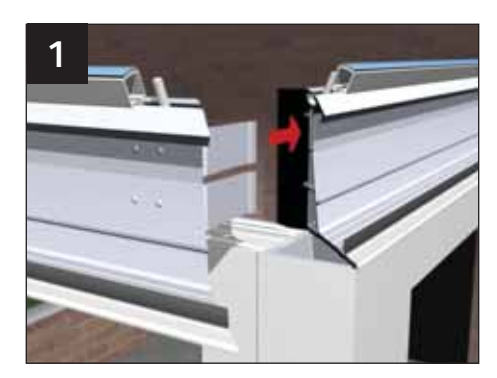
Each eaves corner (90°, 135° and 150°) is supplied pre-fitted with two standard cleats (Georgian 90° illustrated).