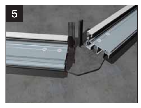
Take the second starter bar and similarly offer this onto the ridge hanger/compression plate assembly. Lift the whole "A" frame assembly and get ready to install it in its final position.