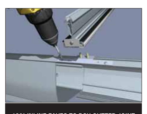
180° INLINE EAVES TO BOX GUTTER JOINT

Note: Only two of the four holes need to be used.